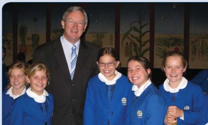
St Luke's Grammar School students on a visit to Parliament House

In the last few weeks I have visited Forestville Public School, Killarney Heights High School, The Beach School and St Luke's Grammar School visited me in Parliament House.