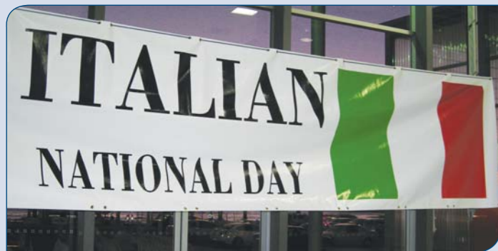
Italian National Day Banner at the celebration

Thousands of Italian and non-Italian locals celebrated at the Hickson Road Wharf, Sydney.