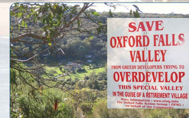
Resident's poster expresses concerns.

However, concern remains that the Minister has failed to make a decision on the most contentious issue – the current retirement village proposal.